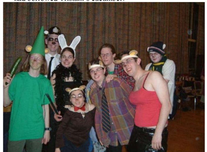
OUSGG: Bearing all!