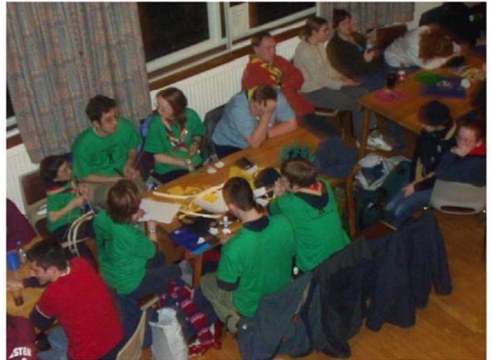
OUSGG hard at work.

Some pictures of the bear rally courtesy of Loughborough's website.