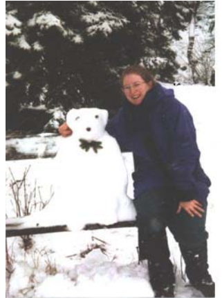
HT 3: Eri>| is at Youlbury

HT 2: Jo in Switzerland, Sorry even I can't find where Eri>| is hidden.