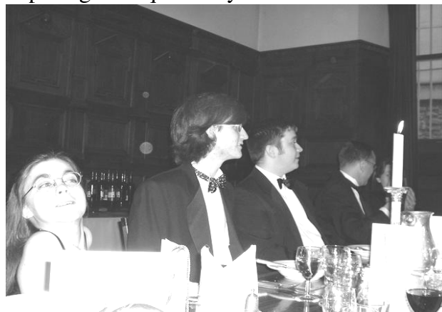
Glamour at 2002's Annual Dinner

Anyone wanting to come to either, or both, please can you let us know. We shall endeavour to send out exact costs in the near future, and hope to get cheques in by the end of term! PS