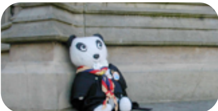
Adventures of Erik