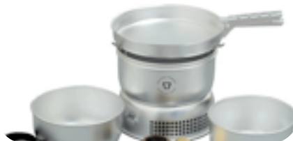
Winter Walking Cookbook