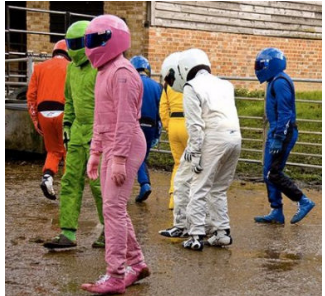
Chair farming...the future of OUSGG